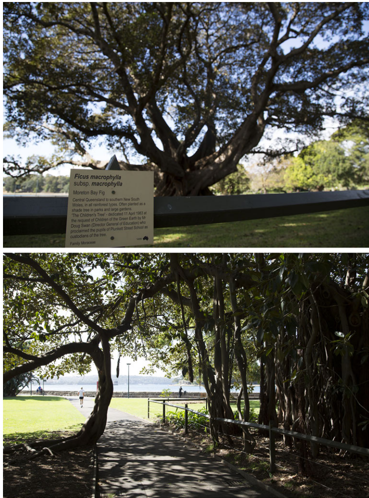
Figures 5 and 6. A gigantic Moreton Bay Fig ( Ficus macrophylla f. macrophylla , top) grows next to a massive Lord Howe Island banyan ( Ficus macrophylla f. columnaris , bottom) in Sydney's Royal Botanic Gardens.

very occasionally being blown from mainland Australia to Lord Howe Island. Following the wasps' lines of flight, Dale determined that both of these varieties were the same species: Ficus macrophylla . He downgraded Charles Moore's 1870 species designation for the banyan to a form: Ficus macrophylla f. columnaris . The form was differentiated on the basis of 'a single conspicuous morphological difference', namely the aerial roots giving the banyan its distinctive macro-structure (Dixon 2001).