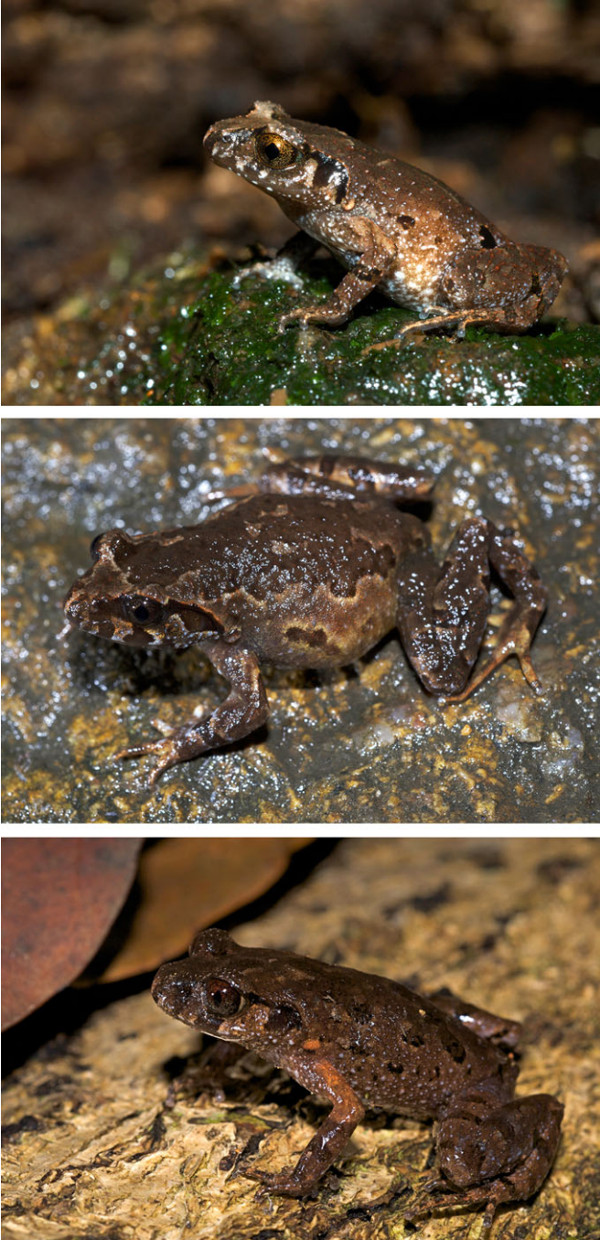
Figures 2, 3, and 4. Leptolalax frogs are difficult for humans to spot – they live among dead leaves and other detritus littering the forest floor in Southeast Asia. Invisibility can mean protection from predators, or from commercial exploitation by humans, but it can also spell vulnerability in an era of extinction. These are just three of the cryptic species described by Jodi Rowley: Leptolalax applebyi , top; Leptolalax botsfordi , middle; and Leptolalax bidoupensis , bottom.